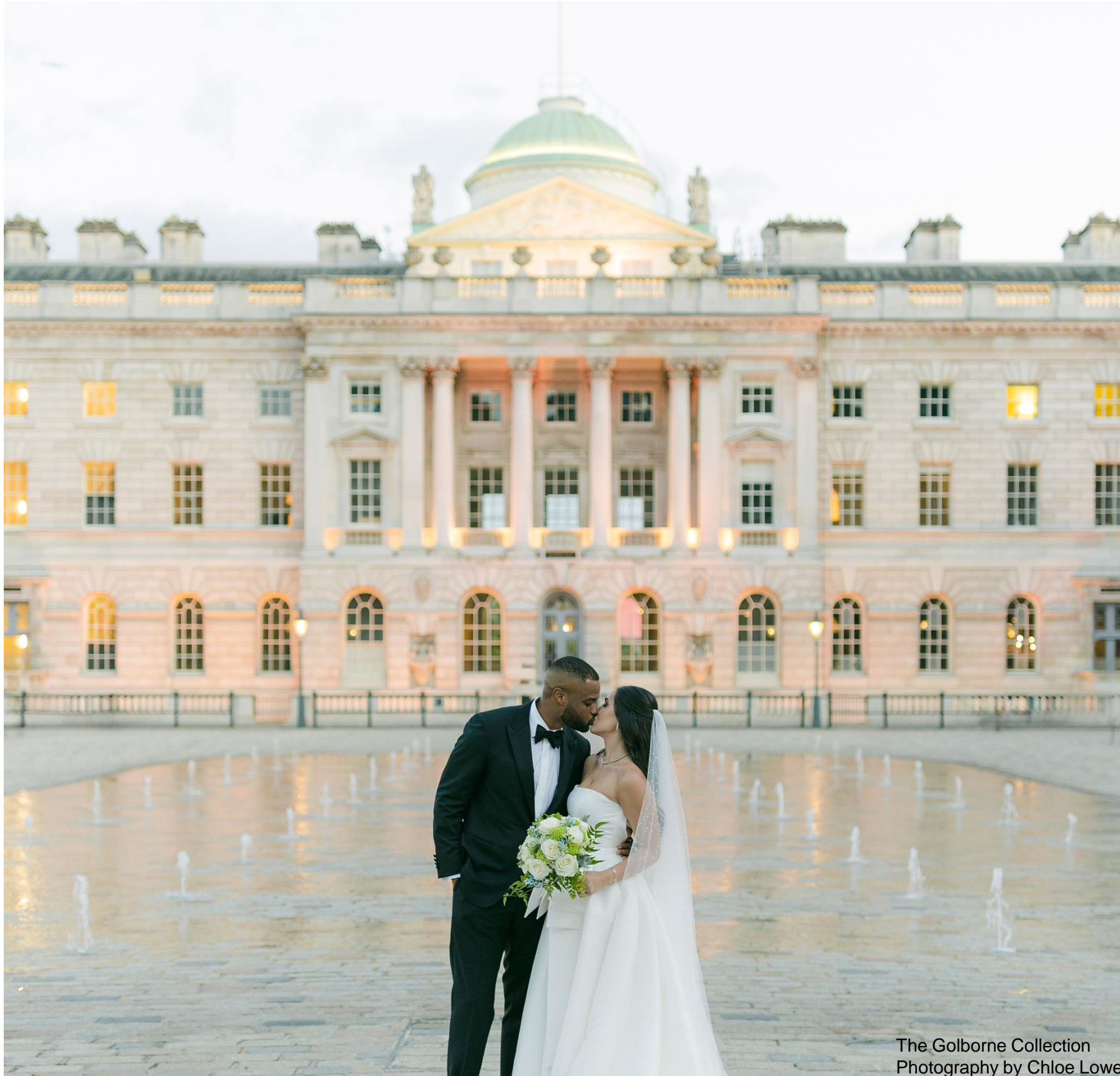
The Golborne Collection