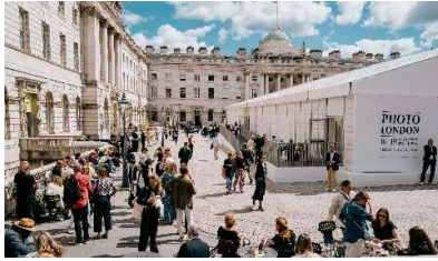
Photo London 15 – 18 May 2025 (Preview Wednesday 14 May 2025) Somerset House site-wide, Tickets on sale in 2025

Photo London is delighted to return to Somerset House for its 10 th anniversary edition. The leading photography fair will once again feature exhibitors from all across the world showing the very best of the past, present and future of the medium, alongside a Public Programme of Exhibitions, Talks, Awards and Book signings.