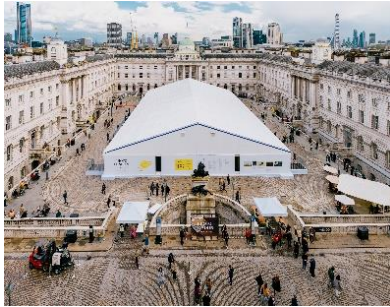
Photo London , the leading art fair for celebrating the past, present, and future of photography will return to Somerset House for its ninth edition in May. The 2024 edition will celebrate the rich traditions of photography and explore the medium's future possibilities as it crosses the boundaries between photography and other art forms, showcasing everything from thought-provoking historical and rare vintage prints to boundary-pushing contemporary works.